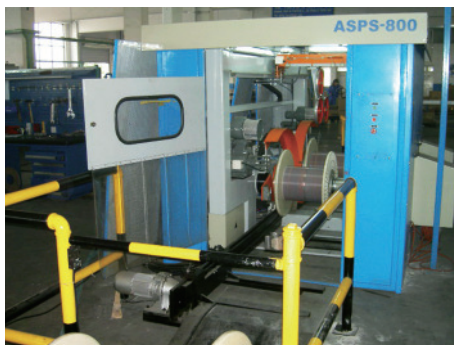
ASPS 800 全自动双盘收线装置 ASPS 800 Automatic dual take-up