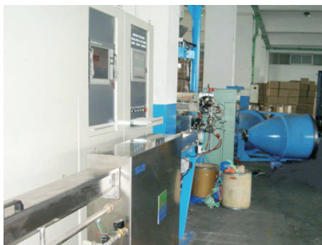
计算机化电控及瑞士仲巴赫在线控制系统 Computerized electric control and In-line control (Zumbach)