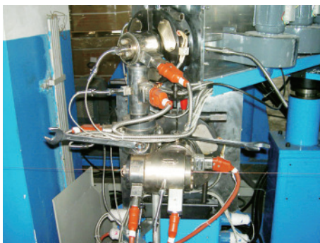
瑞士进口挤出机头 Swiss extrusion crosshead