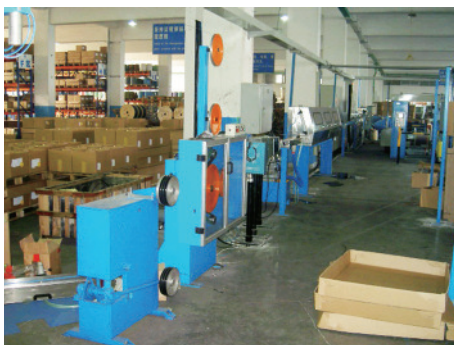
汽车电线绝缘生产线 Automotive wire insulation extrusion line

SKS can provide a variety of extrusion lines with high efficient extruders for insulating or sheathing of different electric wires and cables. Different thermoplastic materials (PE, PP, PVC, FEP etc.), XLPE and HFFR materials can be extruded. The line composition can be selected in accordance with the requirements of the customer and the best solution can be offered.